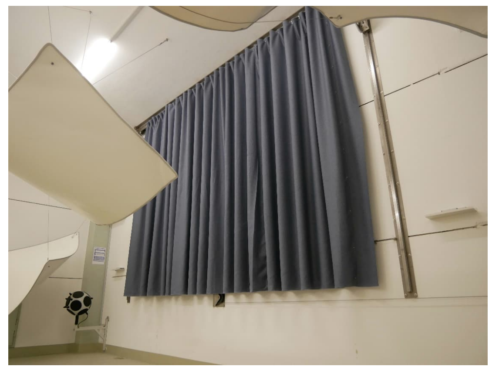
Figure B.2. Test object mounted in the reverberation room, diagonal view.